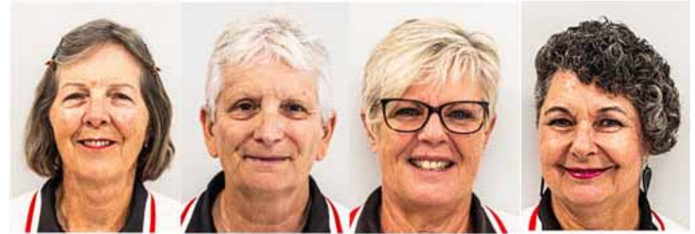
Women's Singles Championship