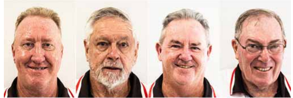
Men's Singles Championship