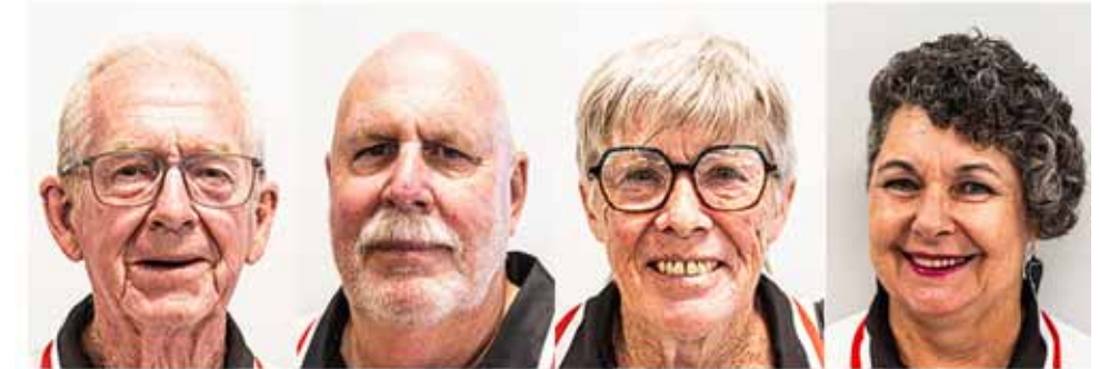
Men's and Women's Novice Singles Championship